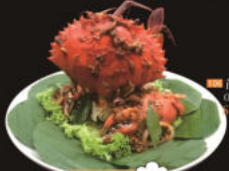
首创印尼焗螃蟹 Original Indonesia Baked Crab Seasonal Price 时价