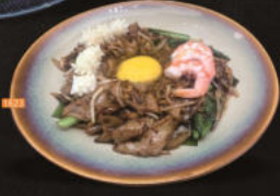
● 海鲜月光河粉 Fried Seafood Kway Teow with Raw Egg $12 $16 $20