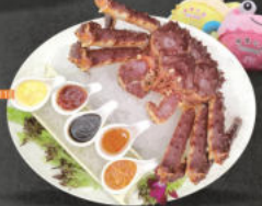
阿拉斯加螃蟹 Alaska Crab Seasonal Price 时价 提前预订 (Pre-order)

一碗有灵魂的螃蟹米粉汤，能让人鲜美，大快朵颐好 胃口! 中国化的蟹粉，蟹的鲜美温和其粉融合， 鲜味和蟹粉香滑一口尝到! A perfect combination of delicacies with subtle flavored crab and the versatile China and warm the consistency of crab meat in a mouth-tingling creamy texture.