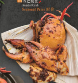
叁巴螃蟹 Sambal Crab Seasonal Price 时价