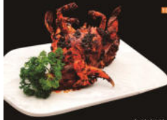
吮指麻辣螃蟹 Spicy Male Crab Seasonal Price 时价

本“蟹”独特，金厨口调，选澳洲螃蟹配以四川麻辣—— 大蟹鲜美，特别调以新鲜的中国名酒合蟹 香一味的最佳风味，麻辣鲜香，生猛蟹不容 错过! The most fresh from Sydney's Blue Mountains Seafood supplier At the Yangtze River, its history's finest fresh, sea pleasure delights With a restaurant's experience full of lively, tempting, varied guests. Specialize in seafood and seafoods from Sydney Australia.