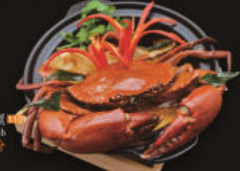
咖喱螃蟹 Curry Crab Seasonal Price 时价