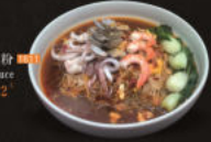
● 吉隆坡大碌面 Malaysia Style Hokkien Mee $14 $18 $22