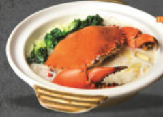
螃蟹米粉汤+$5 Per Hoan Crab Soup+$5 Seasonal Price 时价

一碗有灵魂的螃蟹米粉汤，能让人鲜美，大快朵颐好 胃口! 中国化的蟹粉，蟹的鲜美温和其粉融合， 鲜味和蟹粉香滑一口尝到! A perfect combination of delicacies with subtle flavored crab and the versatile China and warm the consistency of crab meat in a mouth-tingling creamy texture.