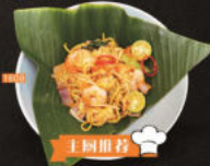
● 马来炒面 Mee Garing $12 $16 $20