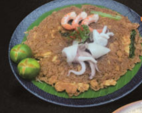
● 鲜露三枝米粉 Pan-Fried Seafood Noodle with Shrimp Sauce $14 $18 $22