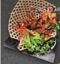
叻沙螃蟹 Laksa Crab Seasonal Price 时价