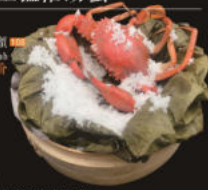
(提前预订) 盐焗螃蟹 (Pre-order) Salt Baked Crab Seasonal Price 时价