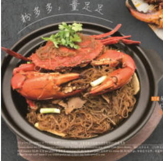
砂煲冬粉螃蟹+$5 Claypot Tung Hoan Crab+$5 Seasonal Price 时价